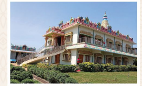
Sai Baba Temple, Dindi