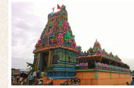
Sri Gelvalamba Temple