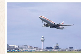
Rajiv Gandhi International Airport